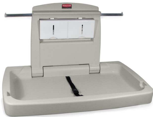
Horizontal Changing Station 7818-88