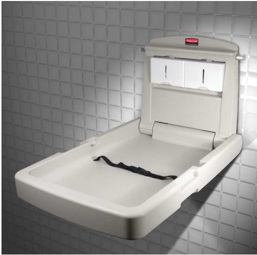
Vertical Changing Station 7819-88